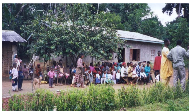
Patients waiting for treatment in Cameroon and listening to the message of salvation before sunrise.